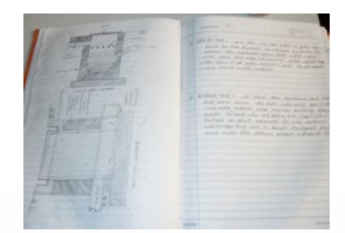
Student workbook sample.

Based on the experience of the last five batches, it was necessary to increase the spread in more areas of Maharashtra, making the course financially more affordable to BPL youth and availing the training near their locality. This stimulated IIEDR to modify the existing training delivery model. We are grateful that IAPMO-India and IPA allowed us the flexibility.