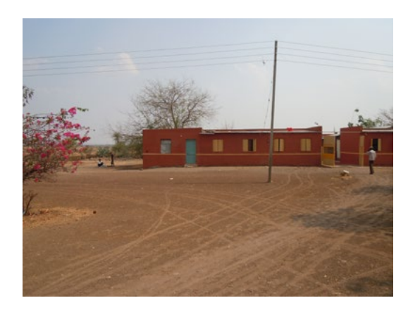
School at the barren land