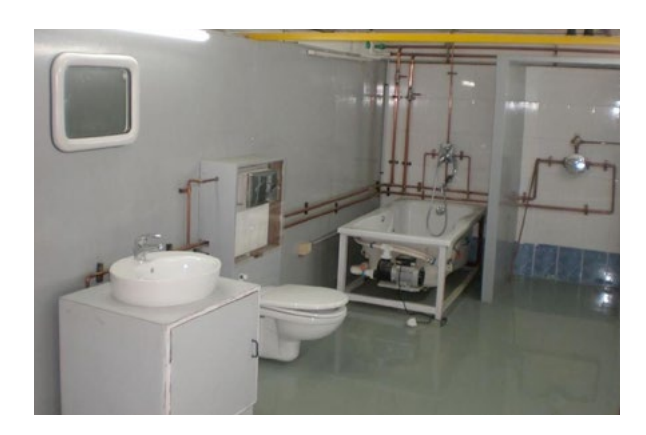
SRATI's Plumbing Lab at Coimbatore