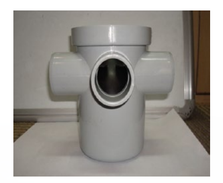
Floor trap with 50 mm water seal.

Mr. Suplekar, however, regretted that though they would like to adopt UPC-I , many fittings are not available in India. In fact, this is a common complaint by many plumbing professionals. The government and municipal authorities are insisting on use of reclaimed water, however, it is difficult to ensure health and safety of people due to non-availability of required appurtenances in the local market.