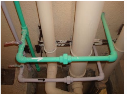
Pipe colour coding and arrow marking.

Hiranandani's efforts are highly appreciated. All other developers and builders should also follow this good example.